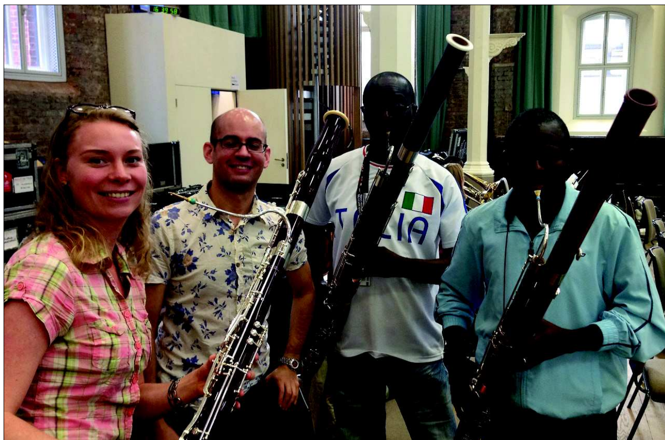
THE HALLÉ AND L'ORCHESTRE SYMPHONIQUE KIMBANGUISTE DE KINSHASA BASSOON SECTIONS

'Come and Play with the Hallé' continues to be a major focus of our Education programme with many thousands of young musicians starting their musical journey playing alongside the Orchestra each year. We were also delighted that this year's series of 'Hallé for Youth'